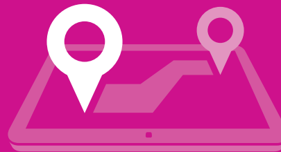
Better journey management