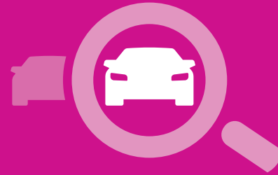
Monitoring driver performance

Combines a smartphone app with online reporting to help SMEs manage their fleets more effectively, efficiently and safely. This complimentary service improves operations through: