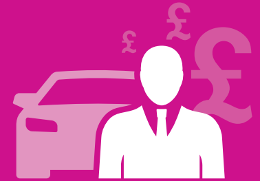
Premium rebates for good driving behaviour